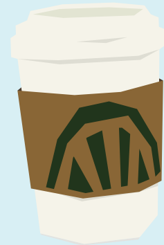
Your Other Office

ALEX® provides personalized, confidential benefits guidance on any computer, tablet, or smartphone. Before you make your enrollment decisions, let ALEX help you find the plans that make the most sense for you and your family.