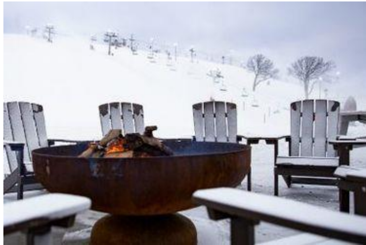
(Wilmot, WI)

FAQ: Who Would Not be Evaluated for WRS Eligibility?