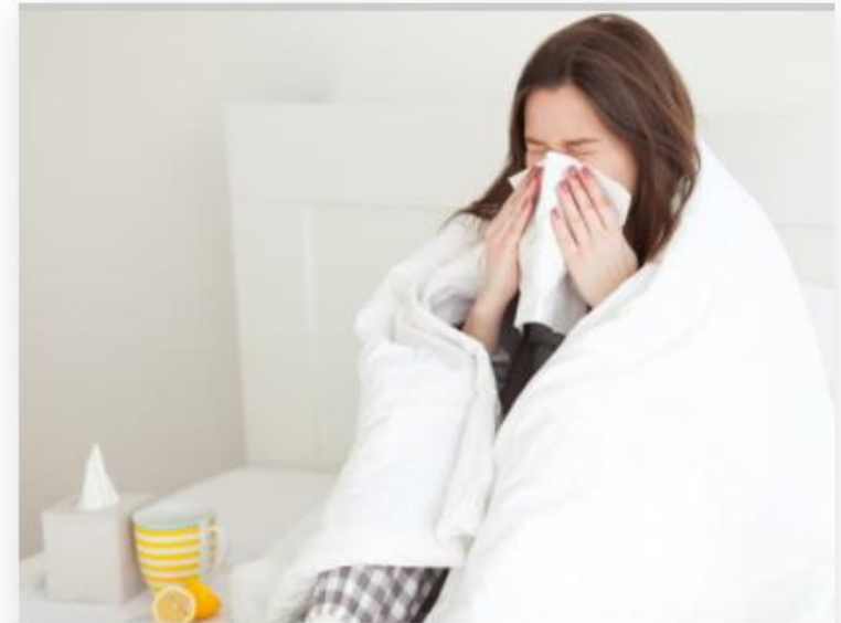
Upper Respiratory Infections