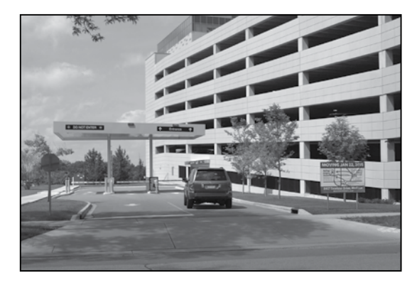
The Hill Farms State Office Building parking garage entrance at Sheboygan Ave. Find visitor stalls by turning right after entering the structure.