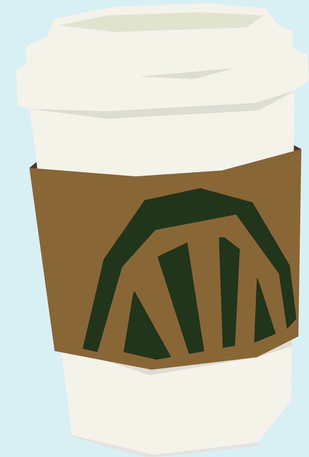
Your Other Office

ALEX ® provides personalized, confidential benefits guidance on any computer, tablet, or smartphone. Before you make your enrollment decisions, let ALEX help you find the plans that make the most sense for you and your family.