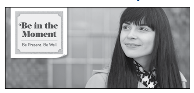
Have You Checked Out the New Well Wisconsin Resources?

We know this year has been challenging for many. Prioritize your well-being with resources like those found with Well Wisconsin to set yourself on a path toward good health for the rest of the year. If you haven't yet, create your new Well Wisconsin account with WebMD for 2021. Resources like the popular Well Wisconsin Radio with health expert interviews, health coaching, Daily Dash, mental health podcasts and more are available. You'll also find videos and articles to help you make healthy food choices, a metabo-