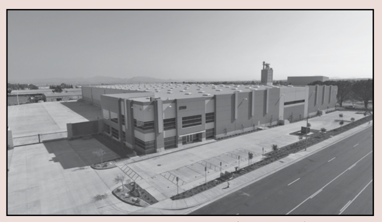
A recently completed industrial asset (warehouse) in California's Inland Empire region.

Although investments are spread across the