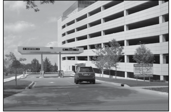
The Hill Farms State Office Building parking garage entrance at Sheboygan Ave. Find visitor stalls by turning right after entering the structure.