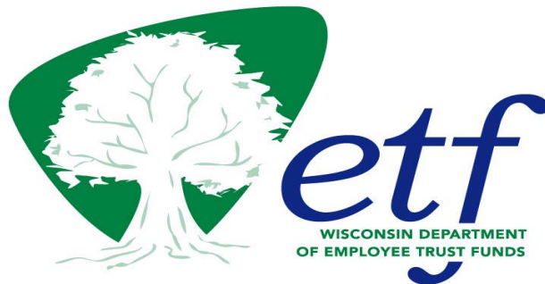
Exhibit 1 to Request for Proposal (RFP) ETG0013 Administrative Services for the State of Wisconsin Pharmacy Benefit Program